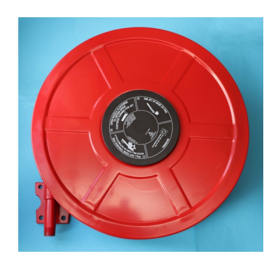
Swinging Hose Reel