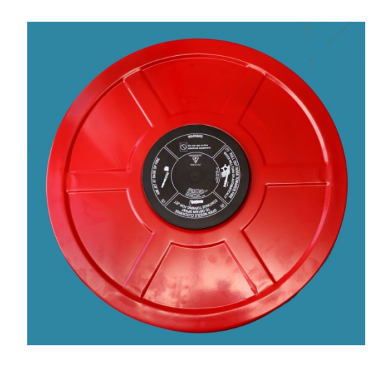
Fixed Hose Reel