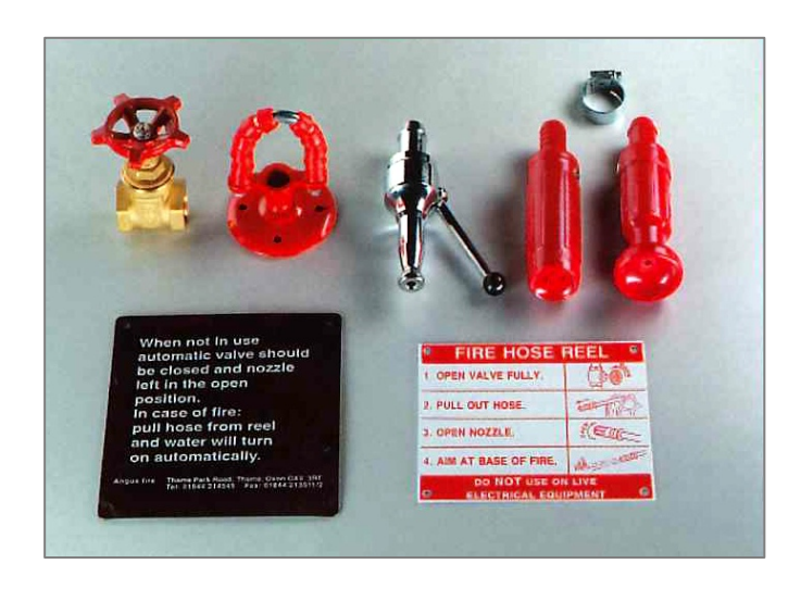
Hose Reel Spares